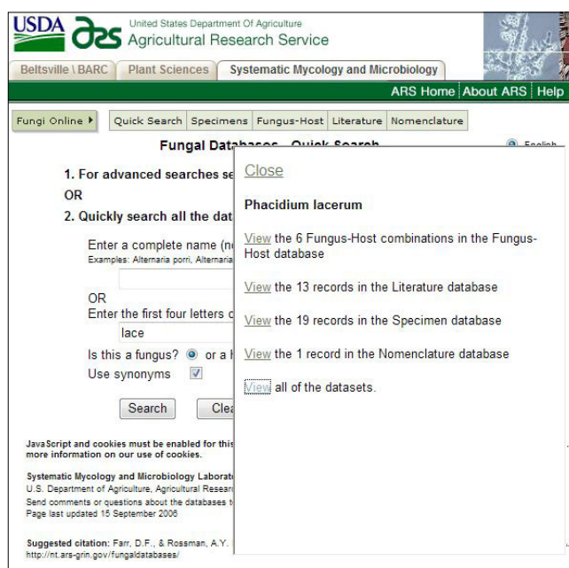
Fig. 5. SMML Fungal Databases http://nt.ars-grin.gov/fungaldatabases/ Search for nomenclator and associated data for Phacidium lacerum .

The principle of priority applies at all ranks of family and below, i.e. the oldest family name has priority unless conserved.