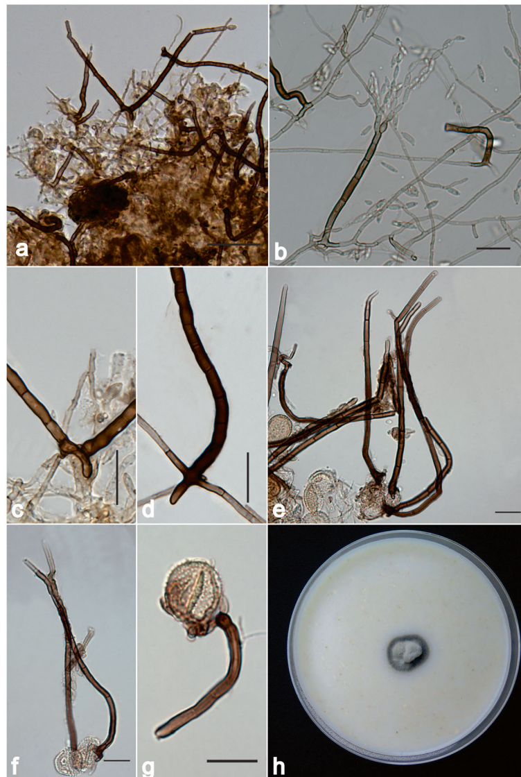
Fig. 2 Digitopodium tectonae on Hemileia vastatrix from Ethiopia (VIC 47361; living culture COAD 2640) and Olivea tectonae (VIC 47183; living culture COAD 2639) from Brazil. a Conidiophores growing over H. vastatrix urediniospores. b Conidiophore bearing conidial chain. c Detail of rhizoid on H. vastatrix urediniospores. d Digitate rhizoid formed on a slide-culture. e Conidiophores formed on O. tectonae urediniospores. f-g Detail of rhizoids on O. tectonae . h Colony of COAD 2640 on oatmeal-agar. Bars = 20 \mu m

(microconidiophores) or in loose fascicles (macroconidiophores). Microconidiophores erect, subcylindrical, almost straight to geniculate-sinuous, (35–) 40–74 \times 3–6 \mu m, 1–4-septate, pale brown to olivaceous brown, smooth, thick-walled. Conidiogenous cells integrated, terminal, subcylindrical, 9–26 \times 2.5–4 \mu m, somewhat thick-walled, pale brown, smooth. Conidiogenous loci sympodially arranged, slightly thickened and darkened. Macroconidiophores erect, cylindrical, flexuous, geniculate, (25) 40–140 \times 3–5 \mu m, sparingly branched, 3–14-septate, dark brown, smooth, thick-walled, rhizoid bases present but poorly developed. Conidiogenous cells integrated, terminal, subcylindrical, 16–40 \times 3.5–4 \mu m, dark brown