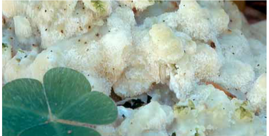
Physisporinus vitreus .

Superior wood for violins – wood decay fungi as a substitute for cold climate. New Phytologist 179: 1095–1104.