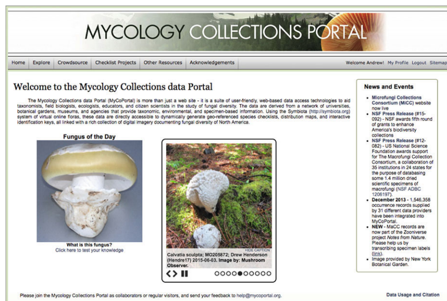
Fig. 1. The Mycology Collections Portal home page.

Key words: data portal, database, fungaria, fungi, genetic data, georeferencing, natural history collections, specimens.