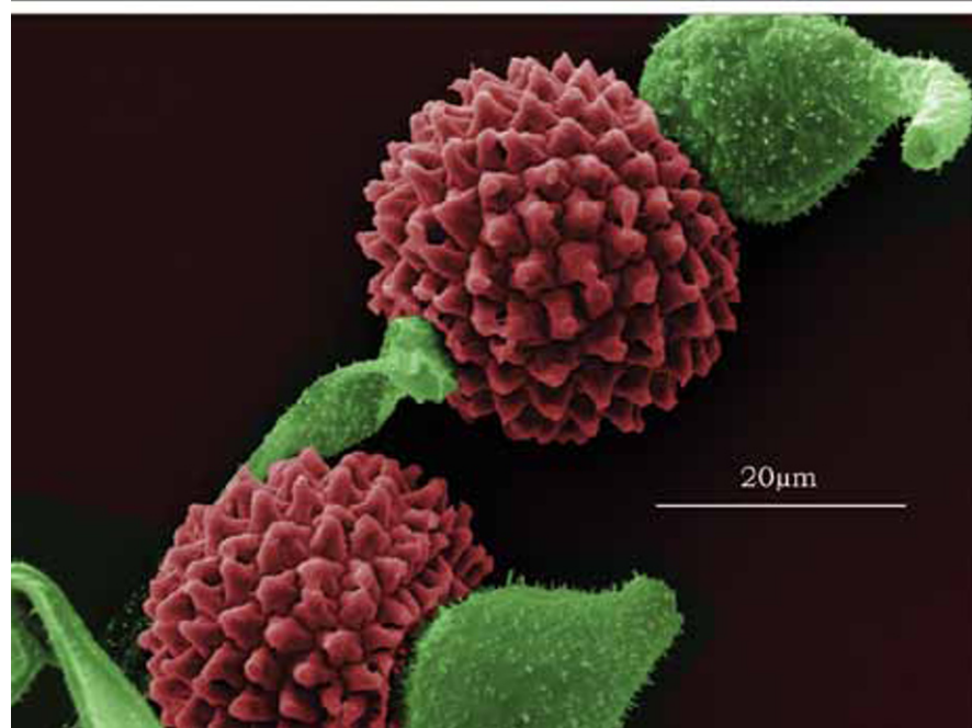
Fig 2. Zygorhynchus moelleri ( Mucoraceae, Mucorales), SEM micrograph.