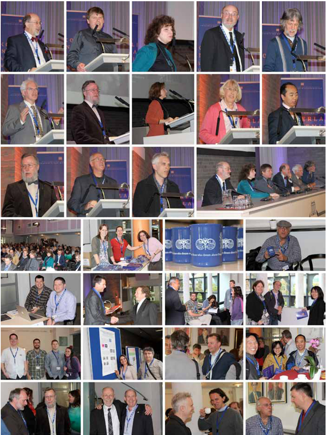
Scenes from the One Fungus = Which Name symposium held in the Trippenhuys, headquarters of the Royal Netherlands Academy of Arts and Sciences, Amsterdam, on 12–13 April 2012.